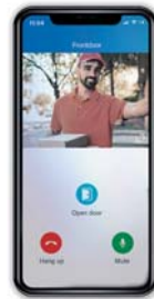
FT600LIC App for smartphones