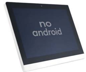
FT600W10 10" IP color monitor

The intercom also has a wiegand connection so that the keypad can be reintegrated into the access control system of the end customer.