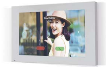
FT600W 7" IP color monitor