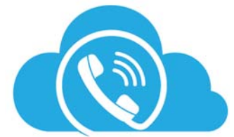
CLOUD BPX Cloud telephone exchange

Our FT600SIP(VC) & FT600KSIP(VC) are SIP intercoms that can be used in all telephony environments.