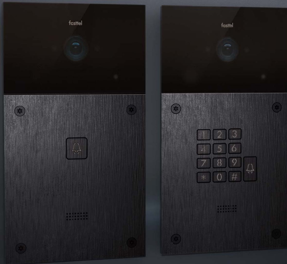
DOORPHONE ENTRY IP