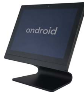
FTB30CC 10" IP/Android color monitor

The outdoor station all have 2 SIP accounts that can be activated simultaneously. This creates the possibility to connect them to our Cloud environment, so that the customer can use the app on the smartphone, but also a simultaneous link to the customer's telephony environment. A 2M pixels Day/night camera is optional.